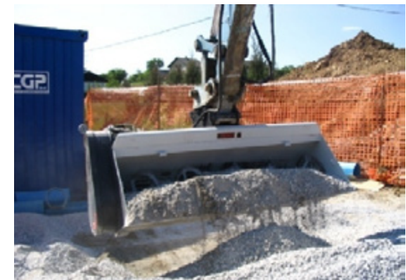
With the Concrete Mixing Bucket