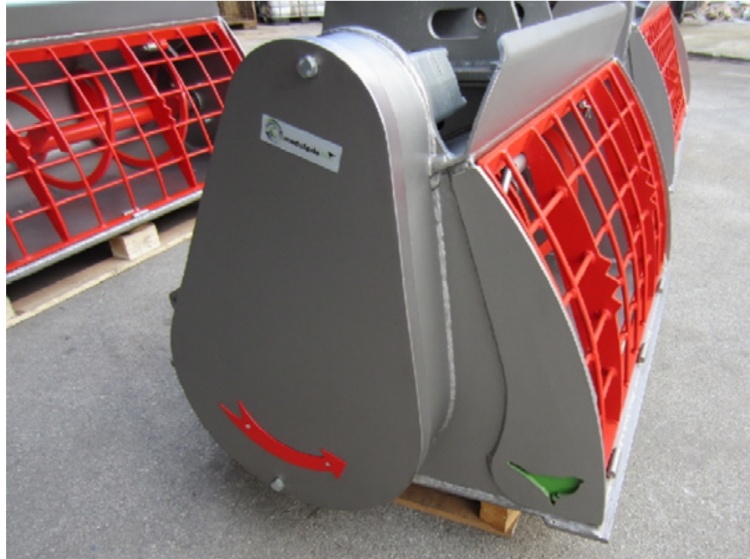
Concrete Mixing bucket