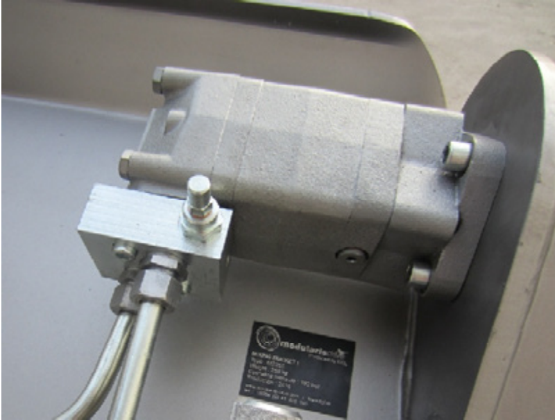
Safety valve on the hydromotor protect the drive and increase the life time