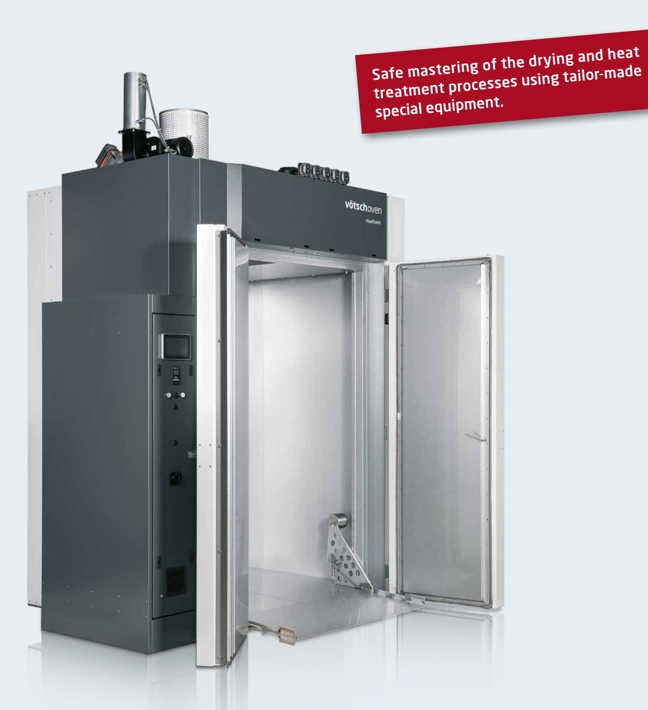
You can find further details on equipment in our technical descriptions. Contact us.

Dryers and Industrial Ovens for drying flammable solvents.