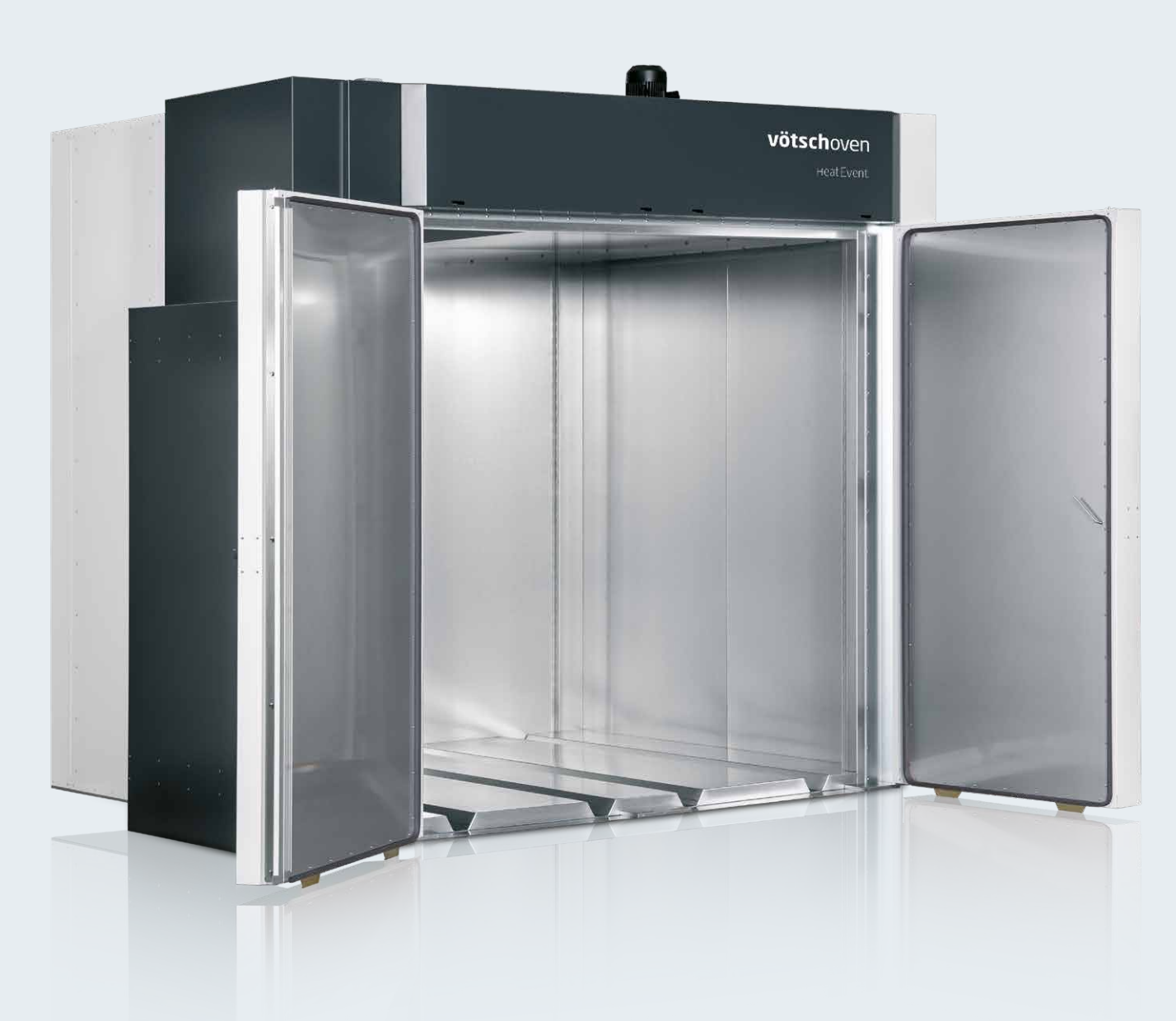
You can find further details on equipment in our technical descriptions. Contact us.