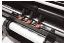
Slitting Module (Optional)