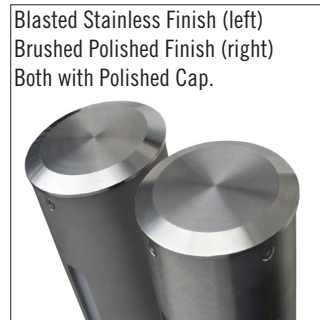
Blasted Stainless Finish (left) Brushed Polished Finish (right) Both with Polished Cap.