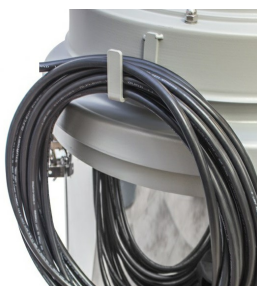
Cable Holder Hook included on the side of the powerhead