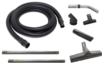
C-10EX Static Dissipative Tools and Accessories - Included