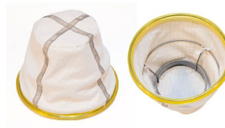
Main Cloth Filter with Cage, Static Dissipative - Included