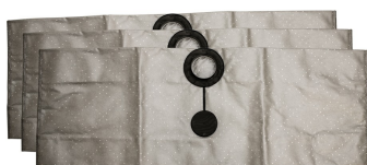
Conductive Recovery Bags - included