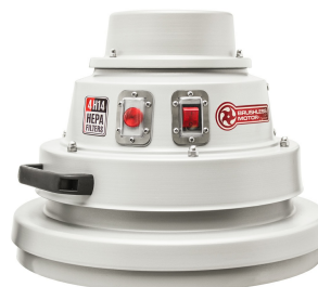
Longer Life Brushless Motor Available (always with 4 x H14 HEPA filters)