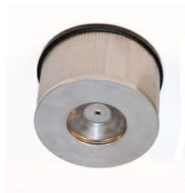
Upstream HEPA Filter - Included