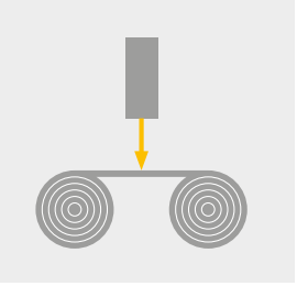
Speed measurement and speed control

Polytec LSV Laser Surface Velocimeters are used in many applications to optimize the process by reducing process variability. You will find them installed in applications such as cut-to-length control, part-length verification, total length on winders, line speed, differential line speed for stretch or elongation and many more.