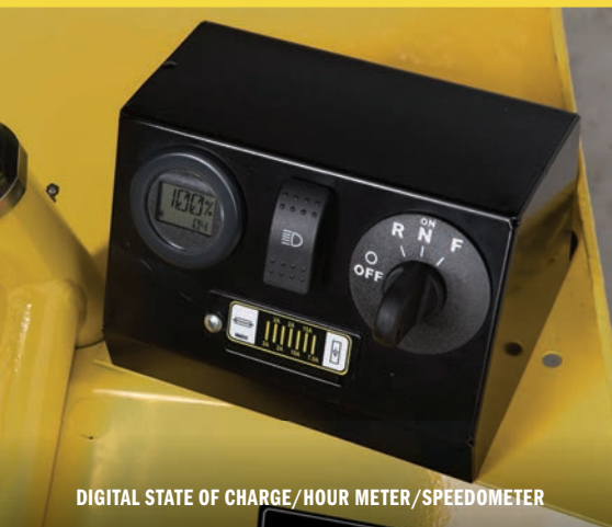
DIGITAL STATE OF CHARGE/HOUR METER/SPEEDOMETER