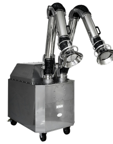
CD-1200 EX STAINLESS STEEL CAT. 2/3GD with optional Dust Extraction Arms