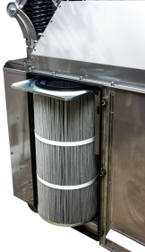
CD-1200 EX STAINLESS STEEL (Filter Cartridges)