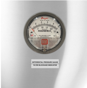
Optional Differential Pressure Gauge for SS Models (Filter Blockage Indicator) available