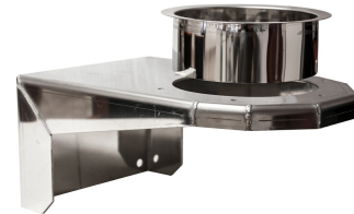
Wall Mount Bracket for Dust Extraction Arm - Optional