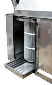
CD-1200 EX STAINLESS STEEL (Pull Out Dust Tray)