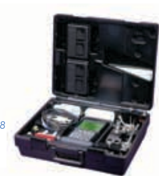
The complete TransPort PT878 flowmeter system fits in a compact carrying case.

When you need a permanent record of your work, live measurements, logged data and site parameters can be sent to a variety of printers by beaming data directly from the TransPort PT878's infrared port. A compact, lightweight, hand-held, infrared thermal printer is available. This printer is powered by a lithium ion battery.