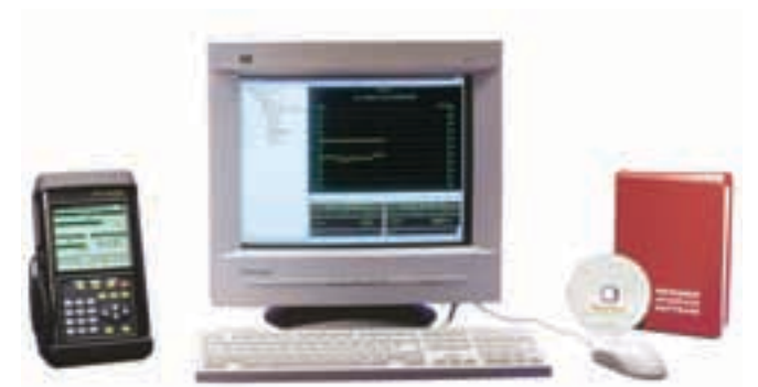
PanaView software links your TransPort flowmeter to your PC.

Infrared adapter plugs into any available serial port to give desktop PCs infrared capability.