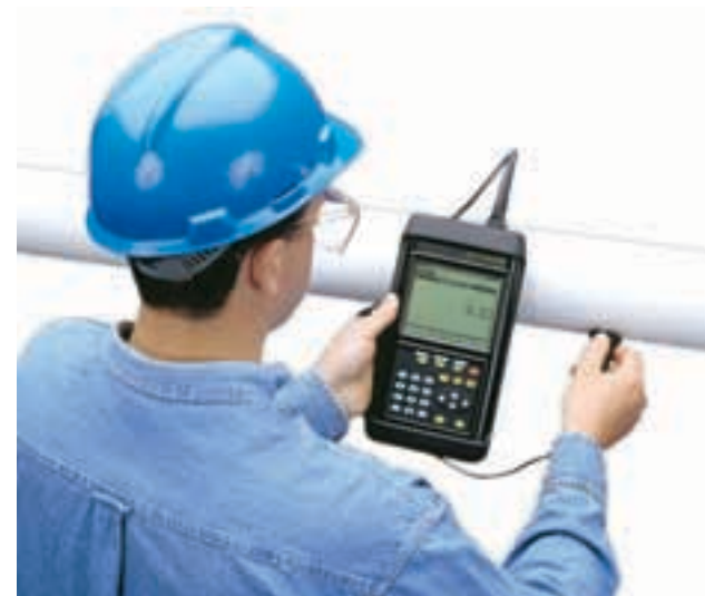
PT878 thickness-gauge option

Continuous operation to 100°F (37°C); intermittent operation to 500°F (260°C) for 10 sec followed by 2 min air cooling