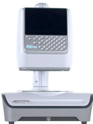
Aeros Reflectance Spectrophotometer