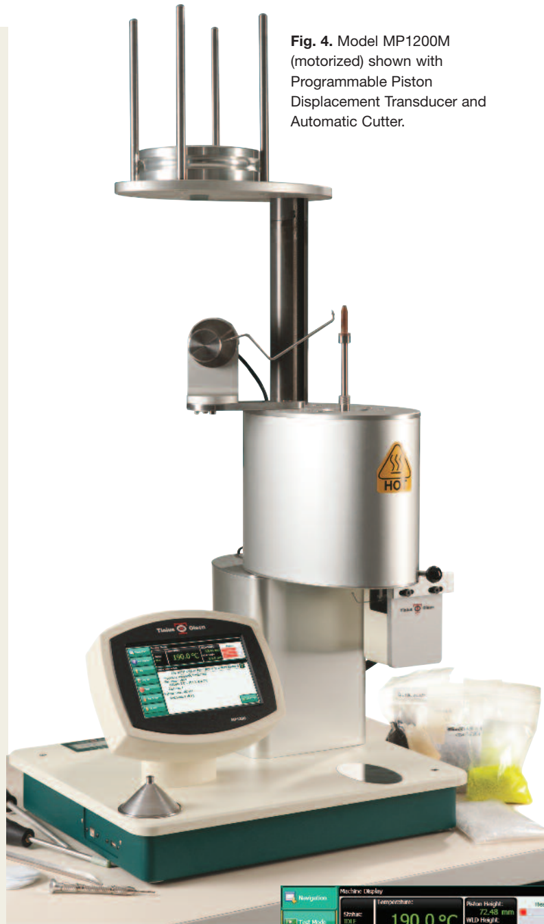
Fig. 4. Model MP1200M (motorized) shown with Programmable Piston Displacement Transducer and Automatic Cutter.

Specifications subject to change without notice.