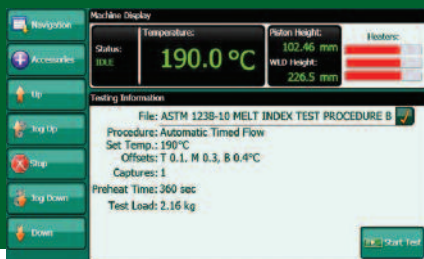
Fig. 5. "Home" screen for MP1200M (motorized).