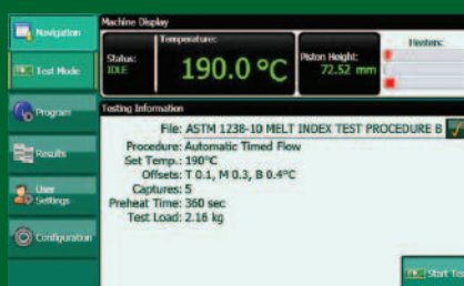
Fig. 2. "Home" screen for Manual MP1200.