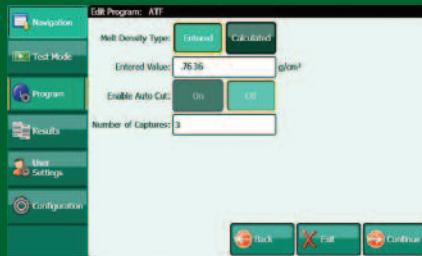
Fig. 6. Program creation screen for automatic time flow and time basis tests.