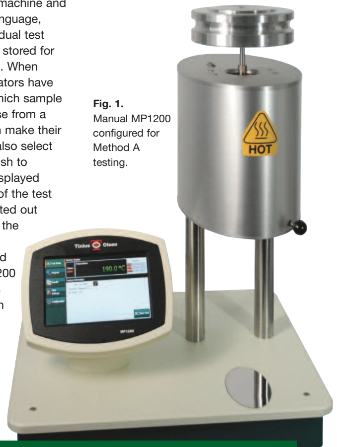
Fig. 1. Manual MP1200 configured for Method A testing.