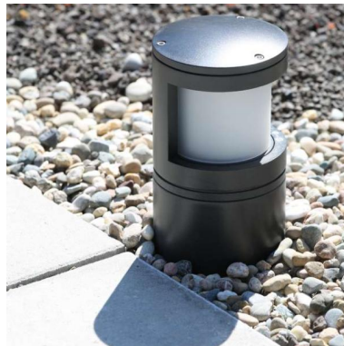
Solarlux GmbH DE - Melle