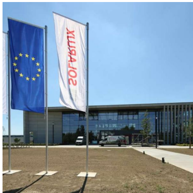
Solarlux GmbH DE - Melle