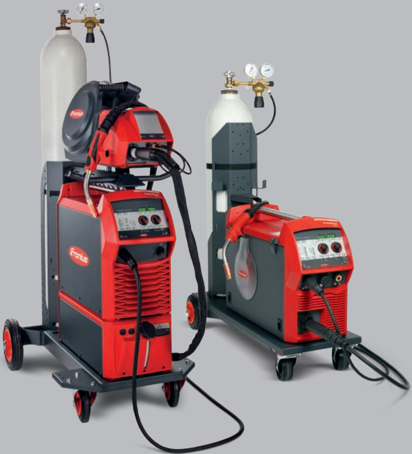
TRANSSTEEL 3500 SYN / TRANSSTEEL 5000 SYN