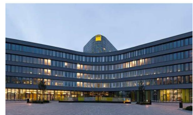
ADAC Zentrum DE - München