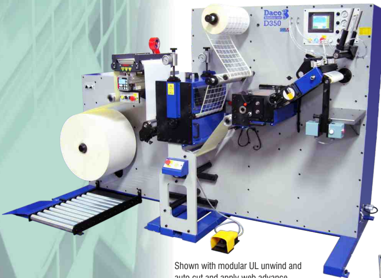
Shown with modular UL unwind and auto cut and apply web advance.

The machine is the ideal solution to clients wishing to produce plain labels for the growing thermal transfer market.