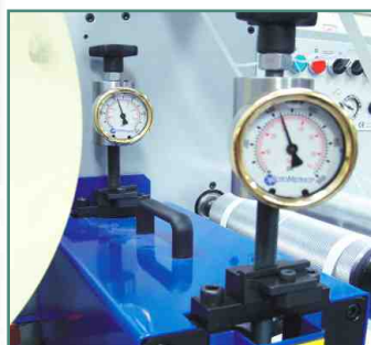
RotoMetrics Hydra Jack die pressure gauges