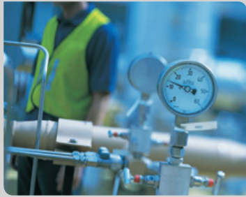
Field Force Automation