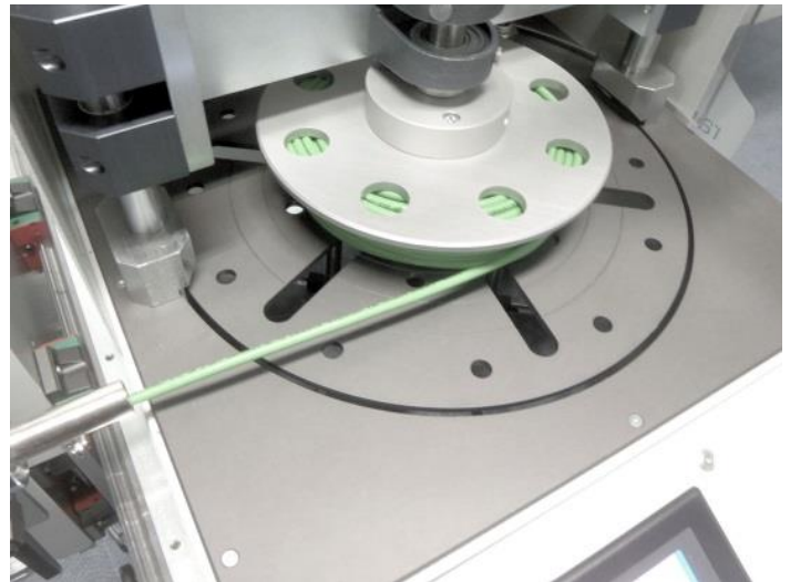
Coiling to rings