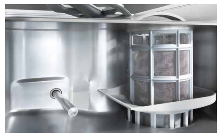
A detailed overview of the PT Series is available on our website at: