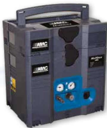
MULTIBOX STORAGE Tools storage box