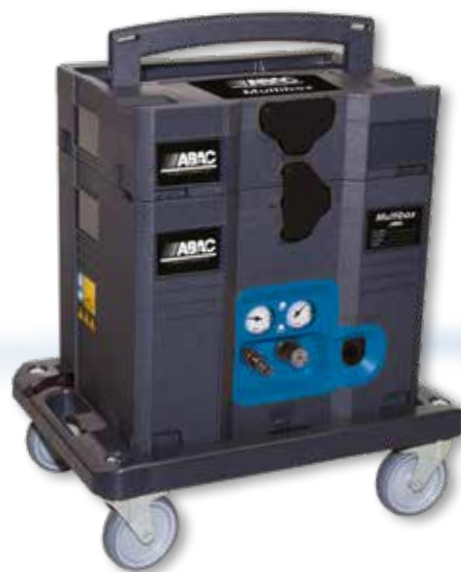
MULTIBOX TRAY Tray with castor wheels