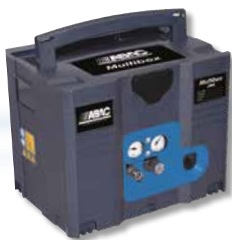
MULTIBOX COMPRESSOR Air compressors