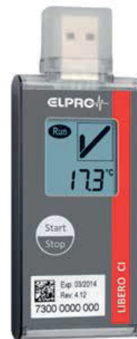
Multi-Level PDF Indicator