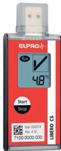
Multi-Level PDF Logger

With LIBERO C and liberoMANAGER, ELPRO offers the most complete and cost-effective Cold Chain Monitoring Solution ever. From production to distribution to the final site, the LIBERO C portfolio and liberoMANAGER are applicable for any step in the cold chain. The LIBERO C portfolio now includes a Multi-Level PDF Indicator. No software to send, no software to receive, no software for reporting and no software for data warehousing – we call it the most complete no-software solution. Designed for pharmaceutical companies with complex distribution chains for commercial products and clinical trials. All components are fully qualified according to GAMP 5 and compliant to FDA 21 CFR Part 11.