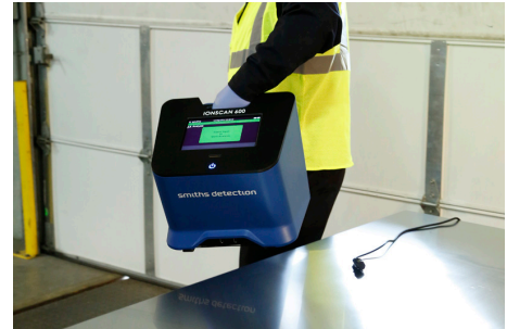
Lightweight and easily portable for dynamic security screening environments. Carry handle available only on non-printer unit.