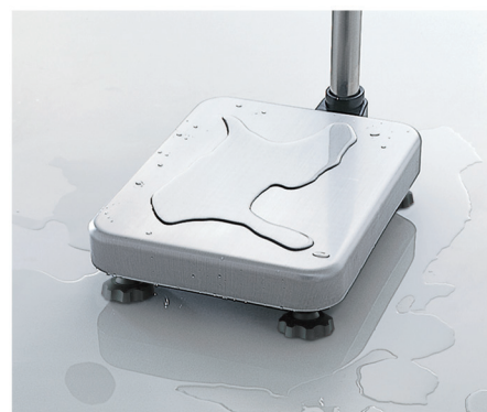
IP65 base unit with a SUS430 pan

In addition to being intrinsically safe, the base unit of the HV-CEP/HW-CEP series can be washed with water and can weigh wet objects without problems. Further, the surface of the pan is resistant to chemicals, scratches and rust, and easy to keep clean and hygienic.