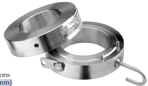
Holder Dimensions Inches (mm)