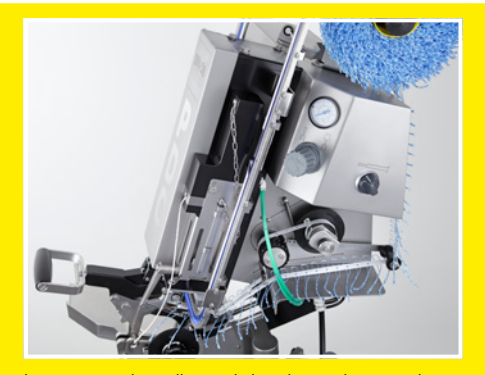
Loops can be clipped simply and securely with the automatic looper (GSE).

The clipper can be placed as required in front of or coupled mechanically with the filler; electrical coupling is possible in addition. When the operator closes the separator, the filled casing is centred at the closure site, separated without emulsion and securely double-clipped. The knife automatically cuts off the desired portions according to the sausage chain lenght adjustment. For hanging-up the sausages, loops can be inserted and clipped automatically.