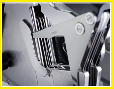
Separator adjustable individually to product calibre - for higher cycle times