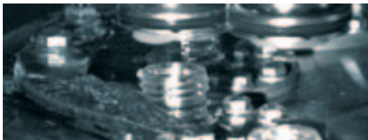
Industrial troubleshooting on a bottling line