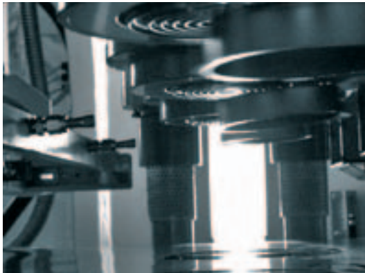
Mechanical engineering on an eccentric press