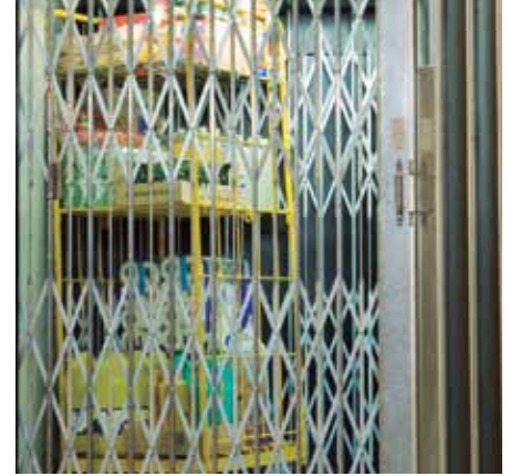
Lift car folding doors: manual picket gates