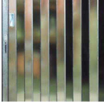
Lift landing folding doors: manual shutter gates