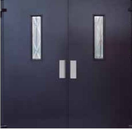
Lift landing doors: manual (standard)