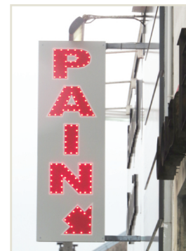
Leds 1 pix (double trait = contour)