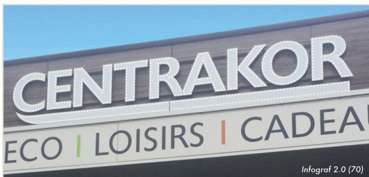
Leds 1 pix (double trait = contour)