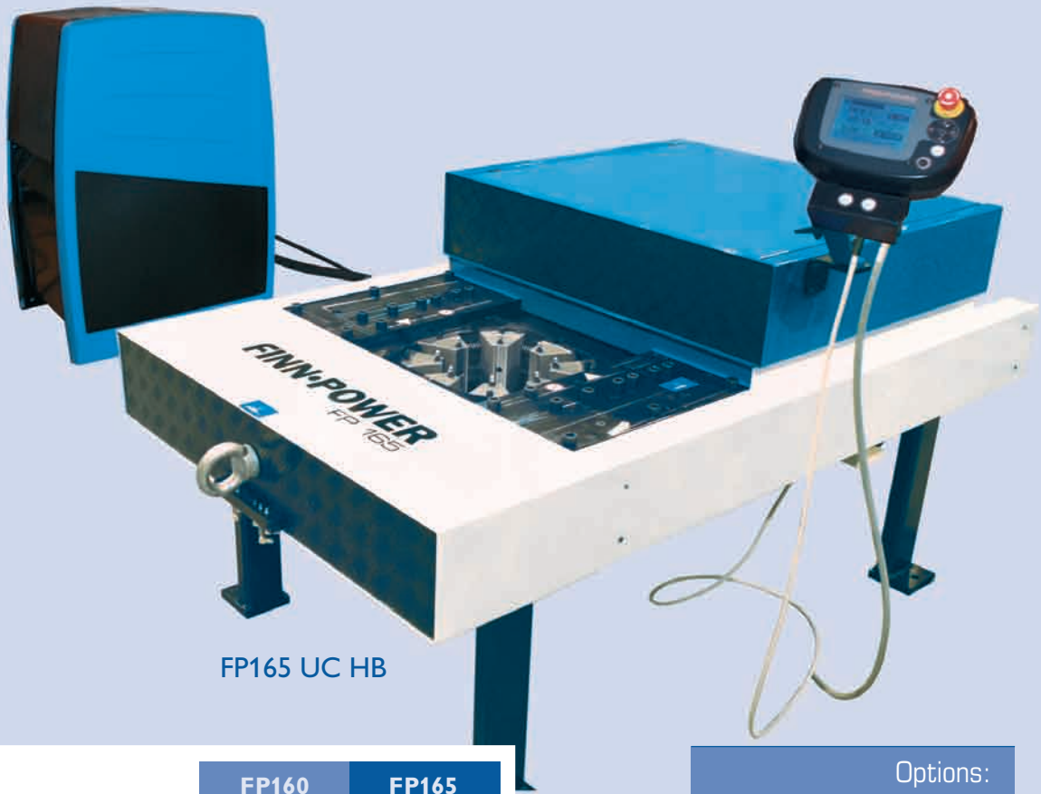
FP165 UC HB