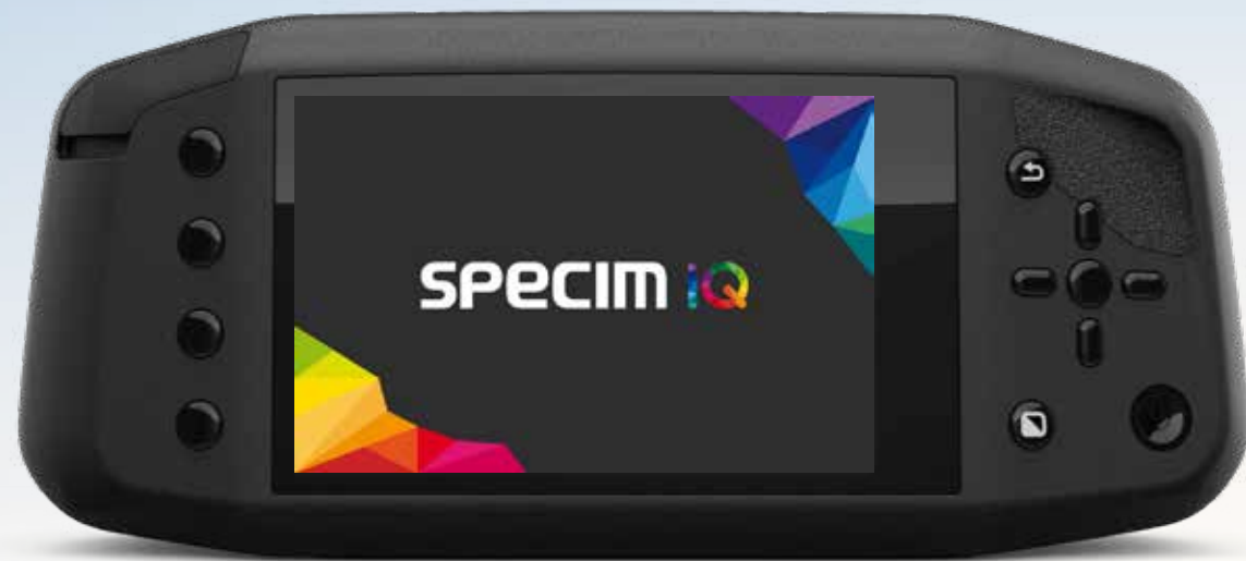
Sensitive Touch Screen