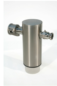
Mercury Recovery Separator with Jar - Included