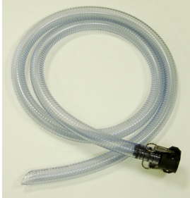
Clear Suction Hose Assembly for use with Mercury Separator - Included