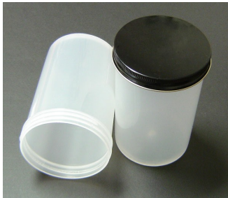
Jar for Mercury Recovery, 20 oz (540 ml) with lid - Optional