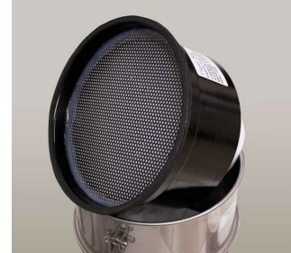
Activated Carbon Cartridge for Mercury Recovery - Included