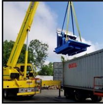
Busy Summer at NORTHERN! Todd STAFFORD