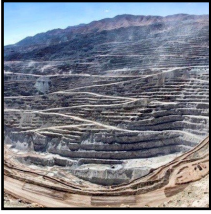
By the numbers... Shelley BACON