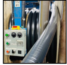
2021 CE Code Changes. Craig McMARTIN