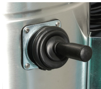
Side Mounted Manual Filter Shaker