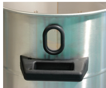
Sight Glass on Recovery Tank