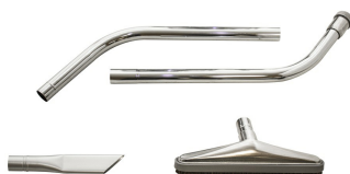
Ø1.5" (Ø38mm) Static Conductive Tool Kit for Single Venturi Models - Included