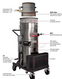
AVSD-1/2 (60L/100L) System Overview