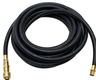
Static Conductive Air Supply Hose - Included