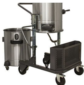
Detachable Recovery Tank for easy emptying