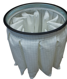
Conductive Star Shaped Filter with Cage for ORDLOC 652 - Included