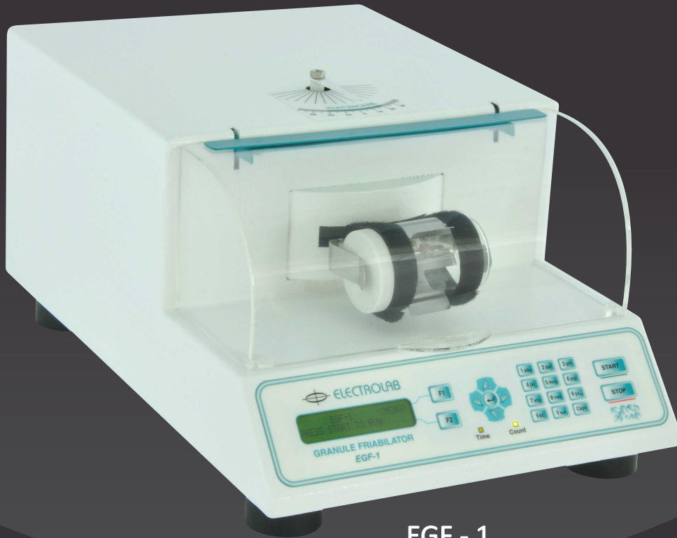
EGF - 1