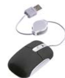
WOM-01 Wired mini USB optical mouse