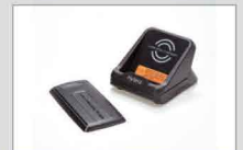
Wireless charging kit POA113