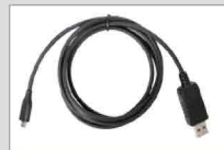
Programming cable (USB) PC69