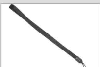
Hand strap RO03