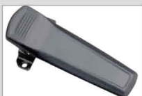
Belt clip BC08