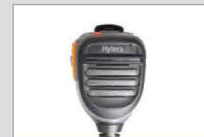
Speaker microphone SM26M1