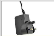
Switching power adapter for charger PS1044