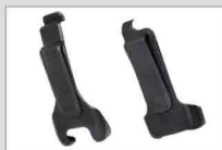
Belt clip BC20/BC21