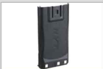
Lithium-Ion Battery (1500mAh) BL1504