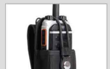
Carrying case (nylon) NCN011