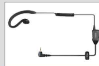
Earphone with C-clip EHS16