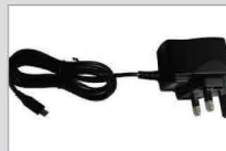
Universal Switching Power Adapter (Micro USB)