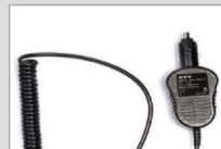
Vehicle power adapter for charger CHV09