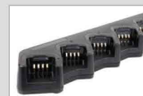
6-unit charger MCA08