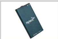
Lithium-ion battery (2000 mAh) BL2009