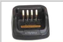
MCU Rapid-Rate Charger CH10A07