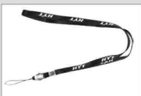
Hand strap RO01