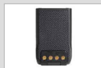
Lithium-ion battery (2000 mAh) BL2010