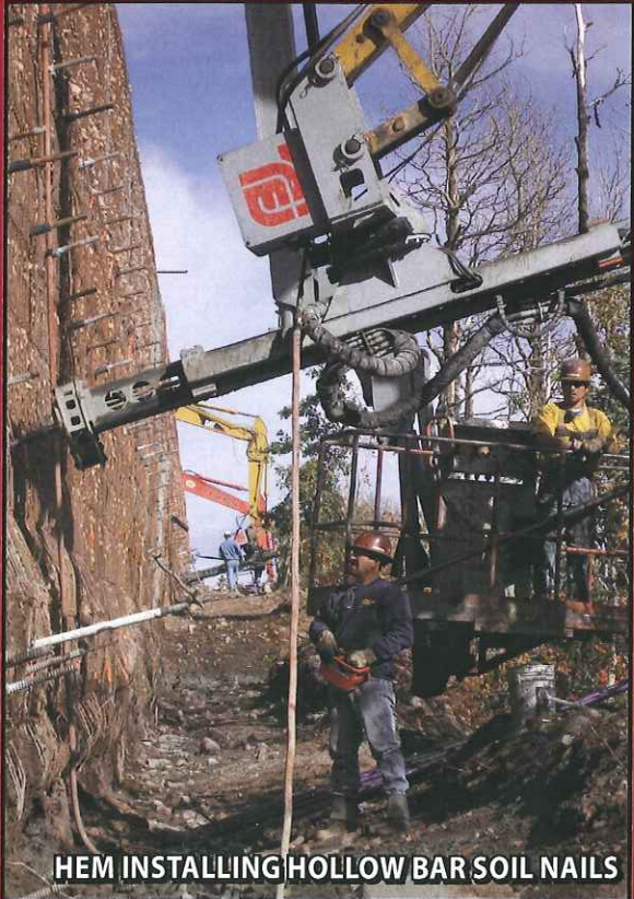
HEM INSTALLING HOLLOW BAR SOIL NAILS