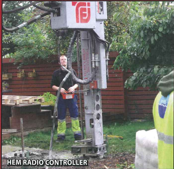
HEM RADIO CONTROLLER