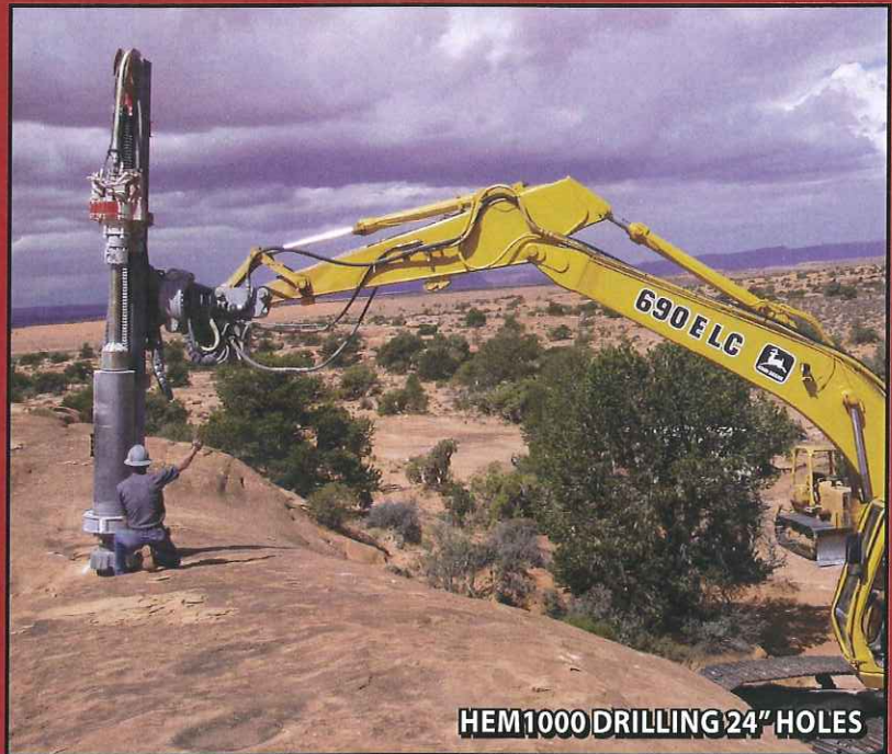
HEM1000 DRILLING 24" HOLES