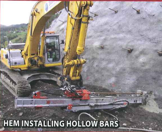
HEM INSTALLING HOLLOW BARS