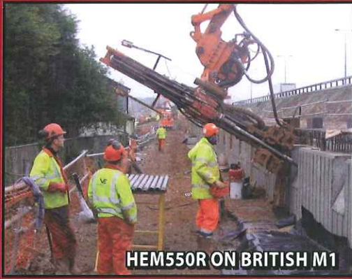
HEM550R ON BRITISH M1