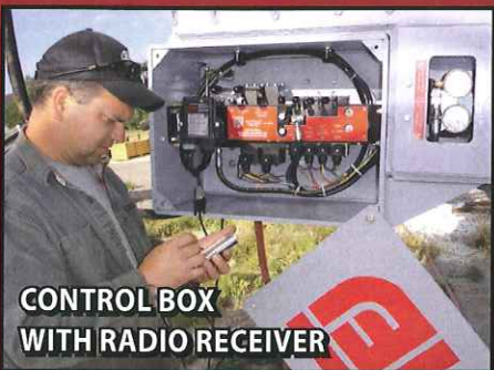
CONTROL BOX WITH RADIO RECEIVER