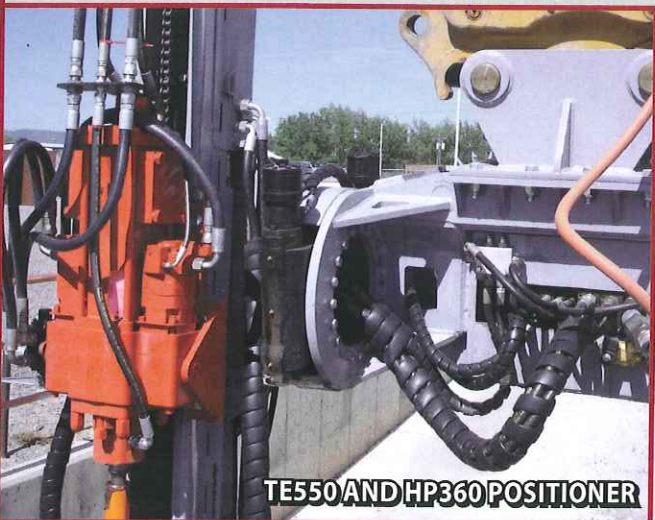
TE550 AND HP360 POSITIONER

The HEM (Hydraulic Excavator Mount) is by far the most popular drilling attachment manufactured at TEI Rock Drills. The excavator provides a very stable drill platform with excellent reach and positioning of the drill mast. Today's modern excavators make it possible to use the 350 series of drifters up to some of the EuroDrill drifters and double rotary heads. With so many possibilities it's easy to see why so many civil and blasting contractors choose TEI's HEM line to get the job done. By looking at these photos you can see the unlimited possibilities with the HEM. Contact your TEI representative to help configure an excavator-mounted drill for your needs.