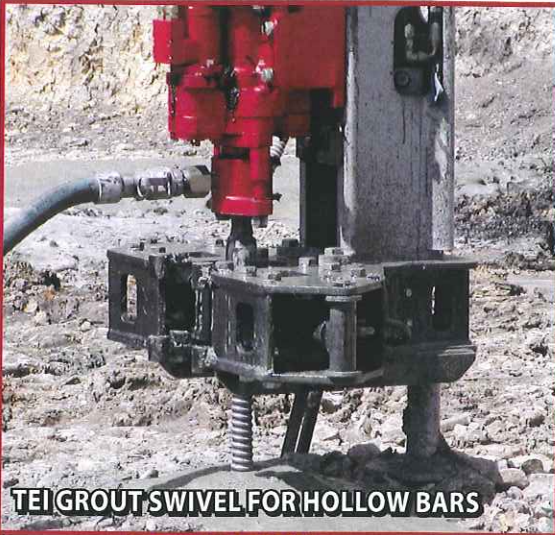
TEI GROUT SWIVEL FOR HOLLOW BARS