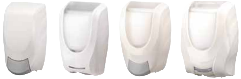
1000 ml Manual