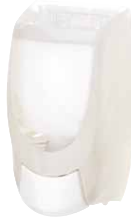
One color & window