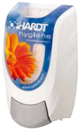
One color & custom window