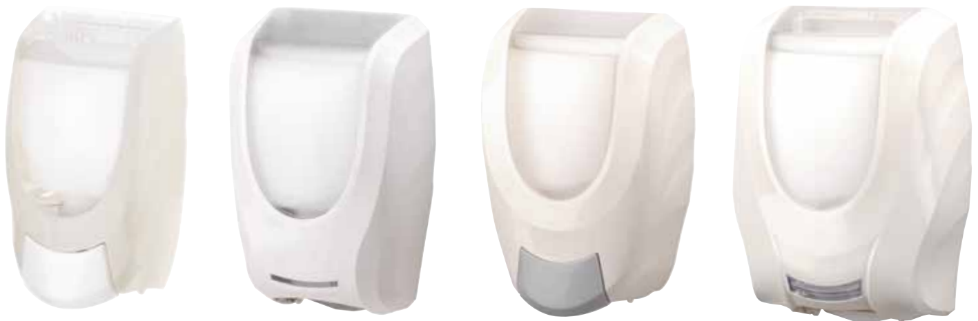
Manual 1000 ml

Your one-stop source for promoting hand hygiene — Let our innovative pumps and customizable dispensers work for you!