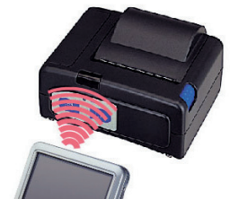
Wireless communication using IrDA