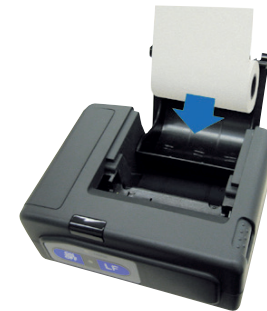
Easy paper loading