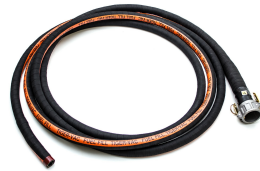
Nitrile Suction Hose - Included