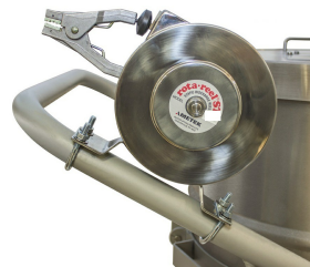
Grounding reel with stainless steel housing and cable - Optional