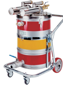
SS-55 (TC) TE TWIN VENTURI