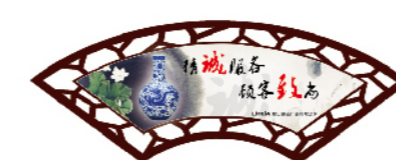
Expansion Board /PVC Board