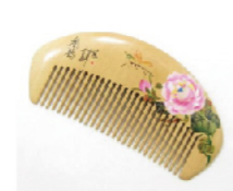
Gift Wooden Comb