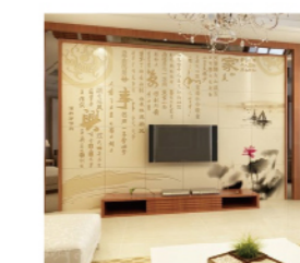
Soft Decoration Background