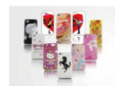
Mobile Phone Shell

UV Digital printer is competent to print most media, with convenient operation, high precision, low cost, white ink solution and without platemaking, UV technology has many advantages in screen printing.