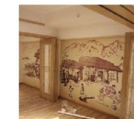
Wall Cloth Background