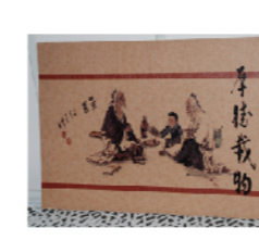
Fireproof Decoration Board