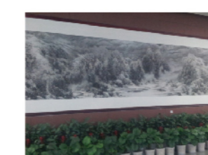
Wall Cloth Decoration