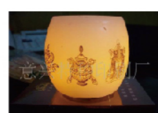
Parchment Light Decoration