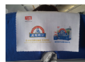
Non-woven/Chemical Fiber Cloth