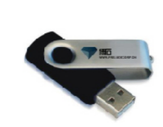
USB Flash Disk