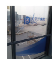
Transparent Backlit PVC