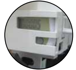
Optional counter tracks dispenser use