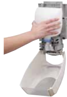
Quick and easy pump and bottle exchange