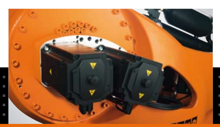
Two motors and gear units in axis 2 and a new drive concept in axis 1 ensure maximum accuracy with heavy payloads.