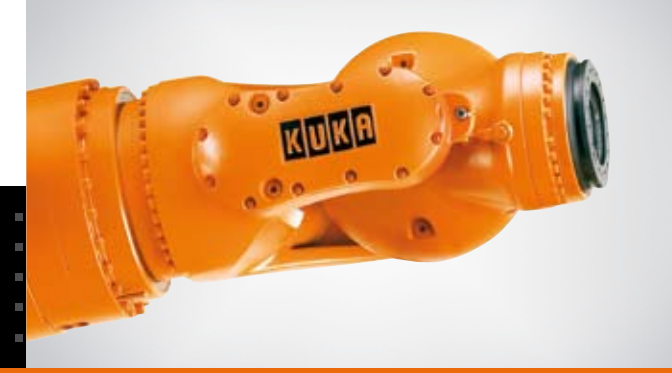
Mechanical components of ductile cast iron and cast aluminum ensure maximum stability combined with maximum dynamic performance.

KUKA offers you a comprehensive range of software: from ready-made application software for the most common applications to simulation programs for planning robot cells and Safe Robot Technology for monitoring safety zones. And for precisely coordinated teamwork with several robots, we offer the RoboTeam application package. The advantages: maxi mum scope and maximum safety.