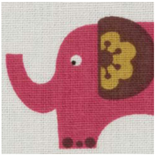
▶ Before applying with the Texture Smoothing function

This software is specifically designed for digital textiles and printings, offering many image improving functions, such as Texture Smoothing, Luminosity Sharpen and Detail Enhancement. ScanWizard DTG is good for using on printing digital patterns in textile, printing, dyeing and ready-to-wear industries.