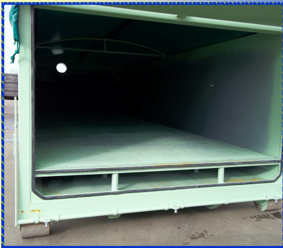
Porte arrière articulation haute