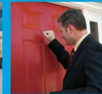
<Door to Door Sales>

M3 SKY series' slim body and light weight will lead you to work at ease. Also, its strength against external impact enables you to carry M3 SKY series anywhere you need to process data not only in a warehouse with full of stuffs but also in tough outside environment. It has been already deployed and widely used in various field such as Logistics, Government branches, Asset management and so on. Its ways to collect data via scanner, RFID, camera and Bluetooth make it possible to play a role as an excellent companion of your work.