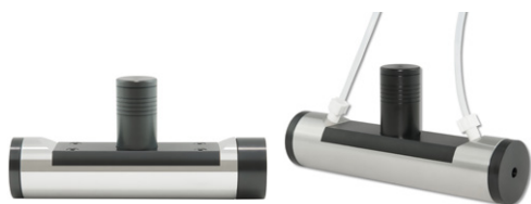
New polarimeter tubes

The new design has nearly half the size of our earlier models packed with new features and highly integrated hardware. The experience over more than 150 years in polarimetry is reflected in all components like AWC , the fortified Aluminum core, the built in quality indicator of samples as well as the check of calibration standards. The 100mm sample room is optimal for the needs of pharmaceutical and chemical laboratories.