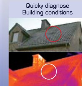
Quickly diagnose Building conditions The infrared inspection locates missing insulation in the roof. This can now be repaired and further energy loss prevented.