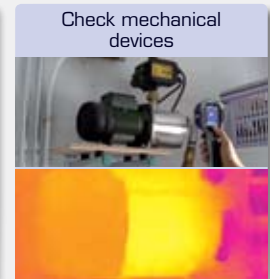
Check mechanical devices Inspection of this water pump shows no problem. The infrared image verifies that there is water in the pump cylinder and there is no danger of overheating the pump.