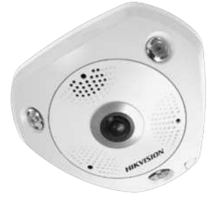
Without -V Model