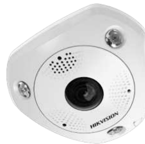
With -V Model