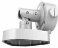
DS-1283ZJ Wall Mount (3-axis Adjustment)