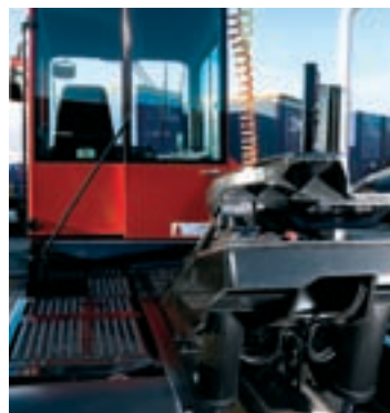
Two double-acting hydraulic cylinders for faster trailer lifting and lowering.