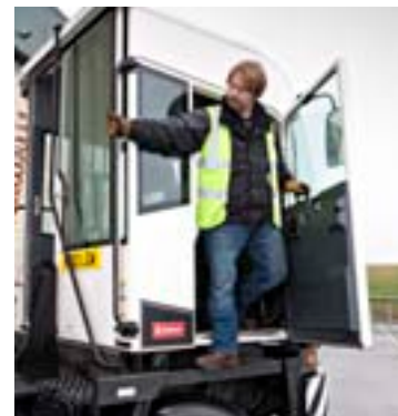
Side door can also serve as an extra exit point improving safety and usability.

The Kalmar TT612d offers superior manoeuvrability in restricted spaces with the smallest turning radius of any distribution tractor – only six metres. Steering is easy, precise and rapid. The hydraulic system provides fast lifting and lowering of the fifth wheel without the need for the driver to leave the vehicle to raise or drop the trailer's landing gear.