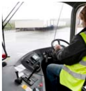
Large windows and angled corners without A-pillars provide excellent all-round visibility.

The TT612d's cab is spacious and comfortable with excellent headroom and legroom. The driving environment has been carefully designed, with all controls conveniently placed and visibility improved in what is also a very quiet cabin.