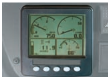
Multi-functional display: all data available at a glance including diagnostics information.

The TT612d distribution tractor's strength, high-quality design and common components guarantee maximum uptime and keep distribution centre operations on the move. With long lifetime expectancy, this tractor has been built to perform even in the harshest conditions. Busy distribution centres and depots are no place for lightweights, so the Kalmar distribution tractor boasts the strongest frame in the industry.