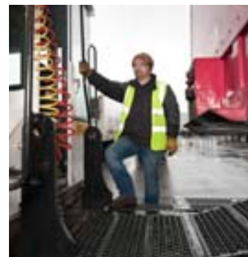
Wide stairways, sturdy handles and even rear deck increase productivity and safety.