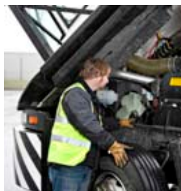
The cabin can be lifted electrically for easy access to engine compartment.