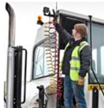
Tall cabin with functional rear doorway – only one low step to rear deck.