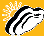
OPTIMIZED FOR ALL SUNLIGHT CONDITIONS